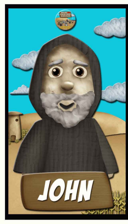
DAY 1 CARD 1 DAY 2 CARD 1 DAY 3 CARD 1 DAY 4 CARD 1 DAY 5 CARD 1